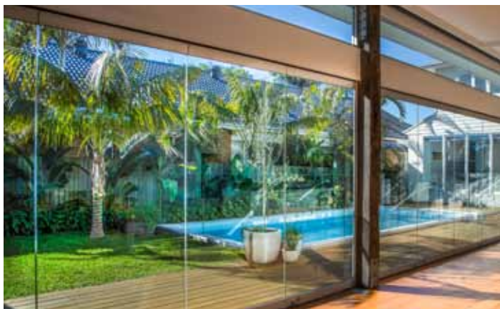
Without Ecolux window film