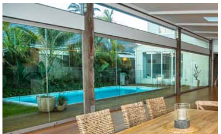
With Ecolux window film