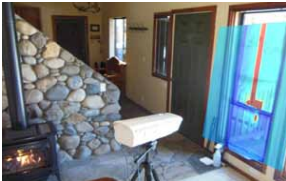
Figure 1: Ecolux 70 on the upper pane reflecting the heat of the fireplace back into the room